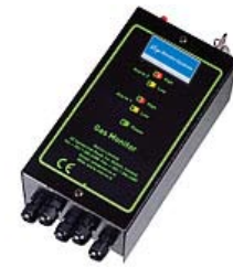
EGD - M